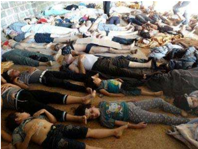
People killed by the gas-attack in Syria

Though the UN tries its best, there are other (neighbouring) countries that can, and currently are contributing to the security of Somalia but as long as things aren't organized properly, as in actually most international or regional conflicts all over the world, solutions will not come as easy.