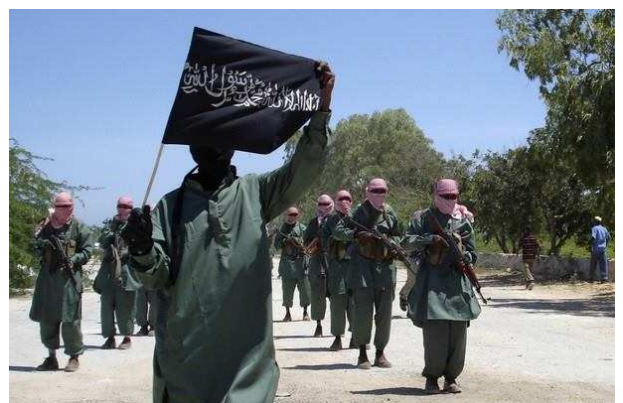
Protestors in Somalia