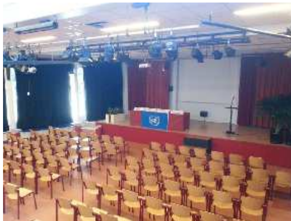
The auditorium is ready for The Opening Ceremonies

It's the morning of BonaMUN and while I'm writing this, all staff-members are preparing the school for BonaMUN, tables and chairs are being dragged through the building. Sweaty armpits, perspiring eyebrows and soaked backs, yes they were working very hard. Flags had to be hung in the auditorium, the lights had to be installed and the folders had to be sorted with the first edition of the BonaMUN Times in it. Now, five hours later, the press room is in chaos. I'm pretty sure I can hear a baby crying, one of the computers is on fire, the deputy head of press is glued to the wall and I am losing hair. In short, a perfectly normal start to BonaMUN 2013!