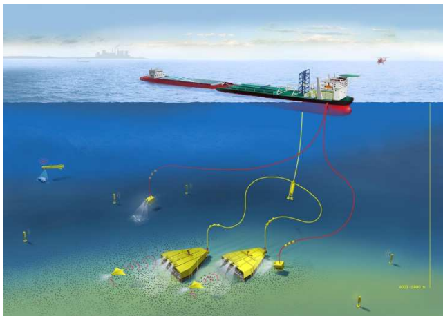
Deep sea mining

Deep sea mining is a method of getting minerals from the sea instead of mining in quarries. It is a relatively new method to get minerals and there are already many complaints about the environmental issues of the method. Just as the name itself says, deep sea mining takes place underwater. Usually at depths from 1400 to 3700 meters below the surface. So the people working with this method go to the ocean floor and drill a hole into the ground. This raises questions with the people protecting the environment such as Greenpeace and other environmental advocacy NGOs. They already said that it should be prohibited.