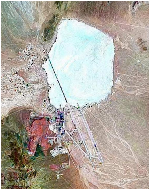
A satellite photo of Area 51

of the world. That was the point where people started to think of Area 51 as some alien military camp. People started to believe it more and more because of weird sightings at night, such as strange lights in the air and aircraft with incredible speed.