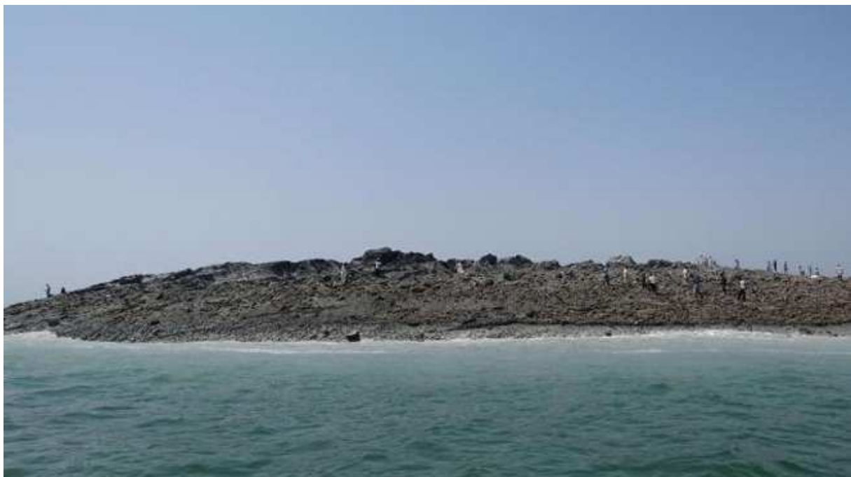
The island created by the earthquake

Local television reported that helicopters carrying relief supplies had been dispatched to the affected area. The army said it had deployed 200 troops to help deal with the disaster.