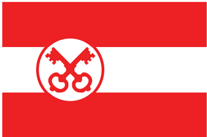
The flag of Leiden